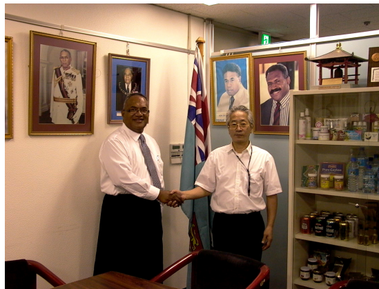
(左)全権大使 (右)環太平洋文化教育交流財団 理事長

2010年3月12日～14日にかけて、南太平洋フィジー諸島(北部)においてハリケーンによる被害があり、現在でもその爪痕を残しております。すでに日本政府をはじめ、世界各国よりさまざまな支援・援助を受けてまいりましたが、6月をもって支援活動が打ち切られており、復興はまだ完全な状況ではありません。この度、フィジー共和国大使館 在日全権大使 イシケリ マタイトガ閣下殿より「被災地の子供達・村々へクリスマスに何かプレゼントしたい」との要望があり、支援協力を要請されました。一人でも多くのご協力・ご支援をお待ちしております。募金の送金方法は下記をご覧ください。